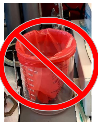
Do not use glass receptacles for biohazard collection!

Glass septum vials, beakers, flasks, reagent bottles, capillary tubes, Pasteur pipettes and slides/coverslips will create a sharp hazard if broken. Review your current procedures and consider non-glass alternatives that eliminate the need to use these breakable devices. If you can't eliminate their use, consider options that have shatter-proof features (i.e., Teflon coating).